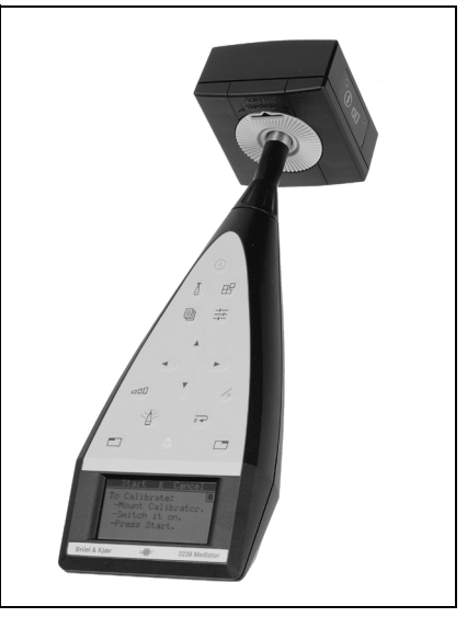
Fig.2 Type 4231 fitted to 2238 Mediator. The calibrator's centre of gravity is positioned very close to the microphone, giving a stable set-up